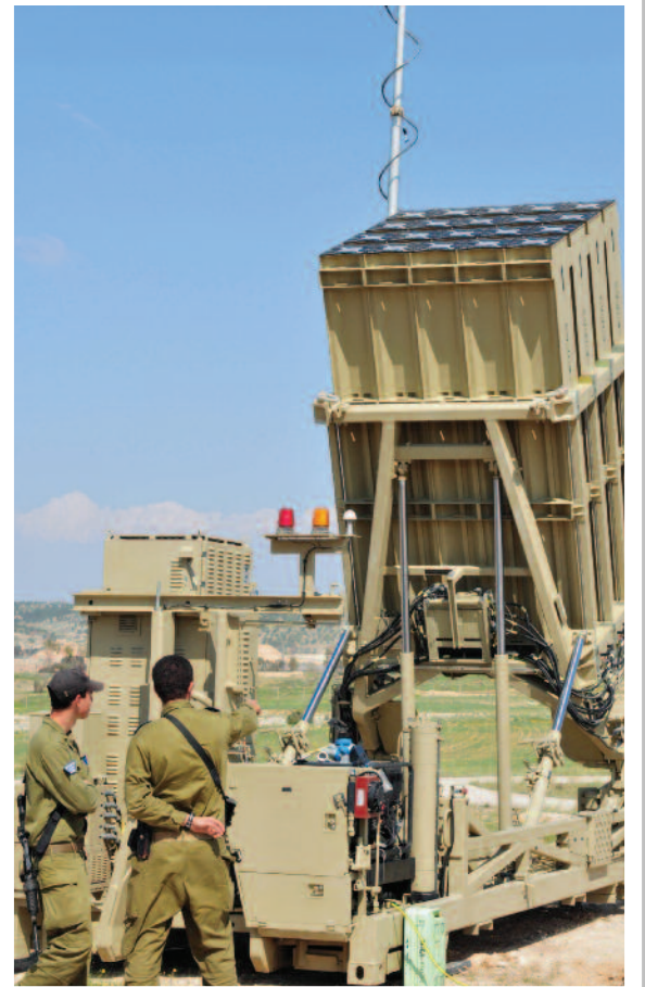
American funded Iron Dome missile defense battery

Another vital concern that remains for Agudath Israel is the safety and security of Iranian Jewry . Living at the whim of a virulently anti-Israel and anti-Semitic regime, many thousands of Jews seek to leave the country. Unfortunately, due to recent U.S. immigration restrictions, the decades-long American rescue of religious minorities facing persecution in Iran (Jewish, Christian, Baha'i, etc.) has slowed down to a standstill. We urge the Administration and Congress to do everything possible to restore the flow of these refugees to freedom and security.