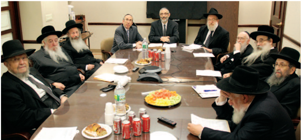
Meeting of the the Council of Torah Sages, which serves as Agudath Israel of America's highest rabbinic body

Agudath Israel welcomed the U.S. Department of Justice Memorandum recently issued by Attorney General Jeff Sessions setting forth all the protections for religious liberty in federal law. It is a strong statement of support that staunchly defends the rights of individuals and organizations to receive accommodation for their religious beliefs and observances. It will be useful in guiding federal agencies to ensure that religious