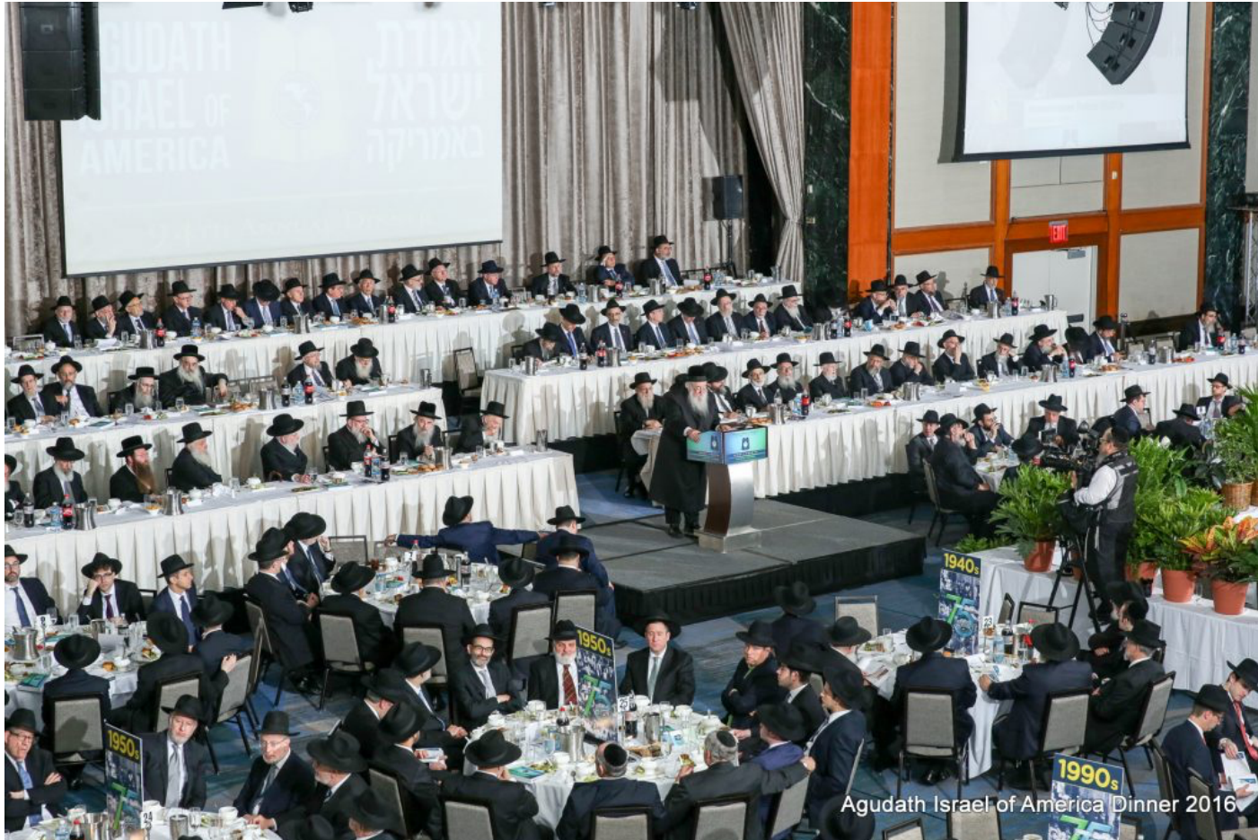
Agudath Israel of America Dinner 2016