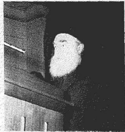
RABBI MOSHE FEINSTEIN

Torah authorities—in their efforts to save Israel and the Jewish people the world over from the collision course towards which the secular leadership is guiding the Jewish Ship of State."