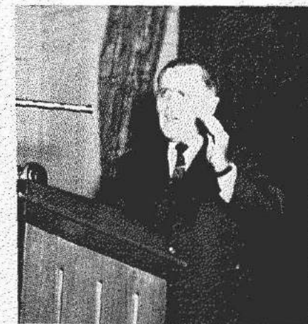
RABBI MOSHE SHERER