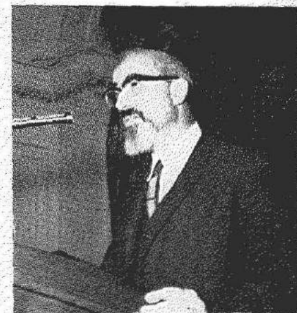
RABBI SHLOMO LORINCZ