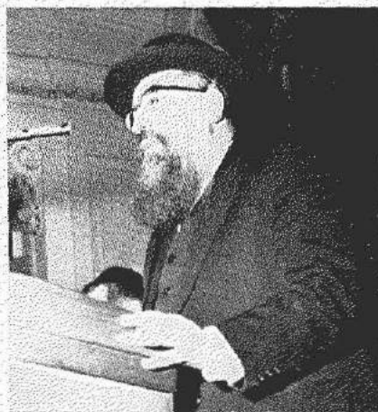
RABBI MENACHEM PORUSH